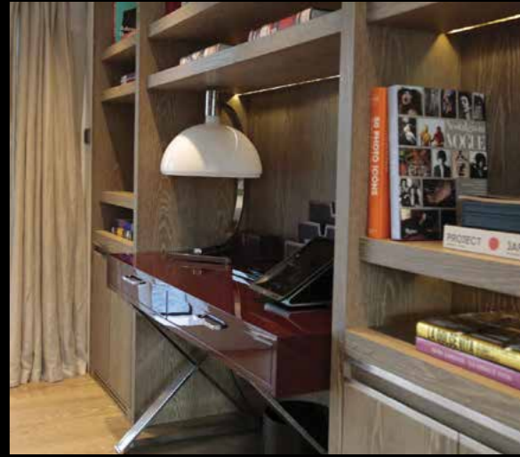
ORIENT STAR BRIDGE DECK