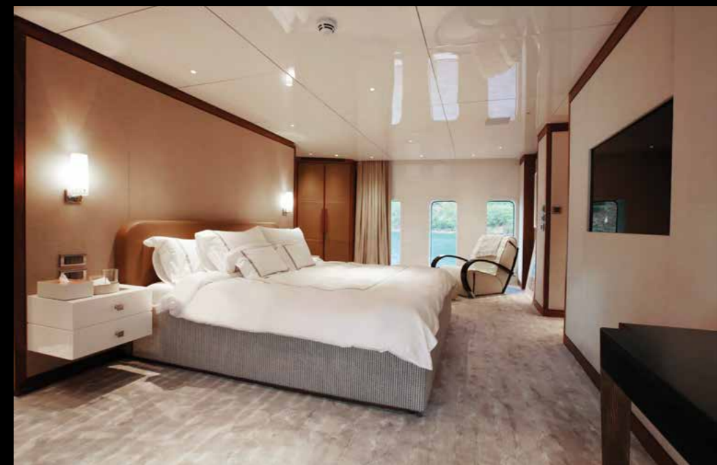
ORIENT STAR MAIN DECK