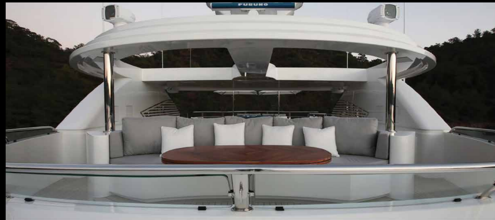
ORIENT STAR SUN DECK